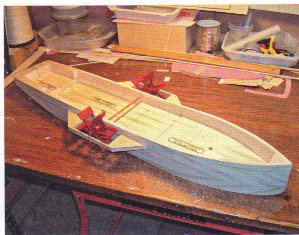
LEFT: P.S. Monarch - start of construction.